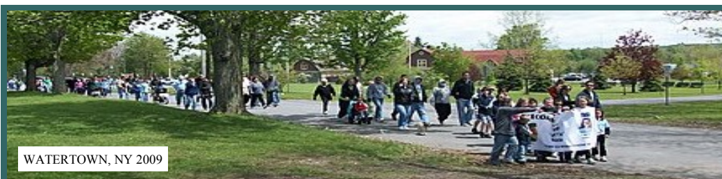
WATERTOWN, NY 2009