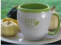
MIF "Never Walk this Path Alone" Mug