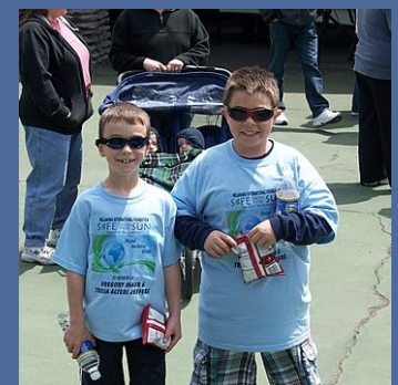
WATERTOWN, NY 2009